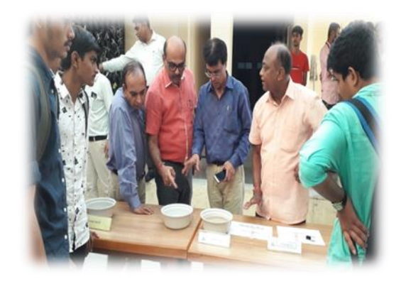
Demonstration of life cycle of such diesease spreders