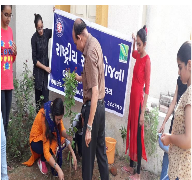
Plantation at Maniben Girls Hostel