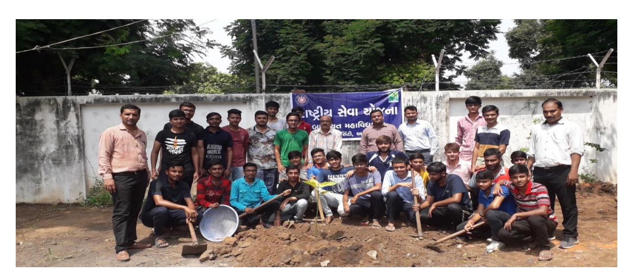
Plantation at Mahatma Gandhi Boys Hostel